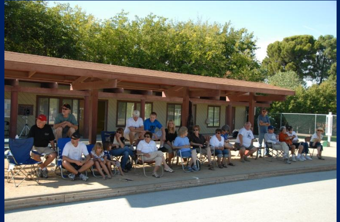
Some of the many spectators taking in the great weather and top class bocce

The top 2 teams from each of the "Five Families" of Antioch, Pittsburg, Crockett, Concord & Martinez would do battle to see which team & club would have bragging rights until October 2012, as being the "best of the best" in Contra Costa Bocce.